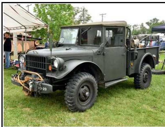
Bill Nutting's M37

As it happened, Friday was off-and-on rain for most of the day. It wasn't constant rain and there were dry times but it was damp and chilly. Saturday saw some morning rain, but then things cleared up and stayed nice until shortly after 3PM, when dark skies and a heavy downpour came through the area. It only rained for forty minutes or so, but that was enough to send most of the public home for the day. The regulars, however, just moved under cover and shopped, or just hung out. After the storm passed it turned into a pretty nice evening, with numerous gatherings scattered around the fairgrounds.