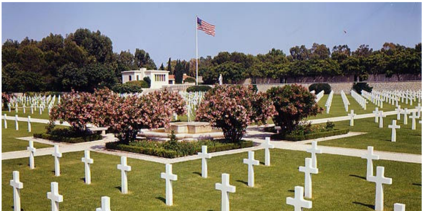
North Africa American Cemetery and Memorial, Tunisia