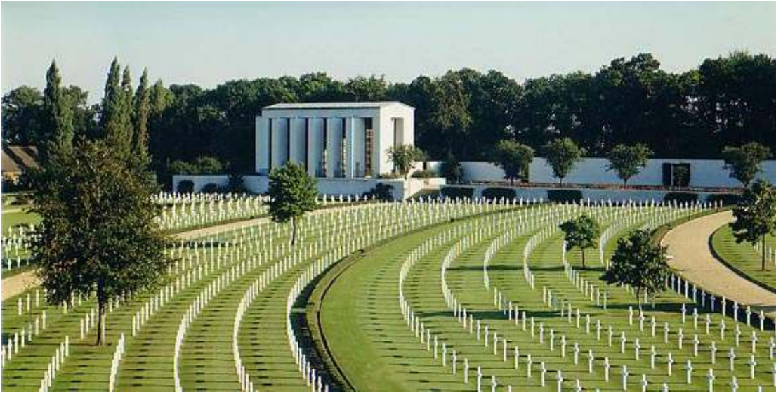
CAMBRIDGE AMERICAN CEMETERY AND MEMORIAL