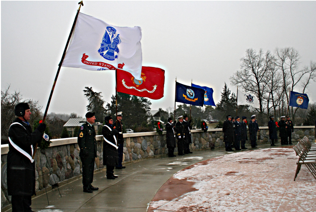
“Wreaths Across America” at Great Lakes Cemetery

Many individual members took part in Color Guards supporting The Paralyzed Veterans of America Salute to Veterans, the Athletes with Disabilities fundraiser, and the Redford Theater Salute to Veterans.