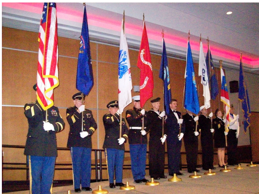
“The Paralyzed Veterans of America Salute to Veterans”

Also, we want to thank the Post and its leadership for the continued support and encouragement they provide.