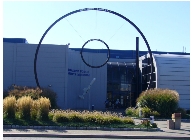
The small ring is the diameter of the first submarine while the outer ring is the diameter of the modern submarines.

On April 11, 1986, eighty-six years to the day after the birth of the Submarine Force, Historic Ship NAUTILUS, joined by the Submarine Force Museum, opened to the public as the first and finest exhibit of its kind in the world, providing an exciting, visible link between yesterday's Submarine Force and the Submarine Force of tomorrow.