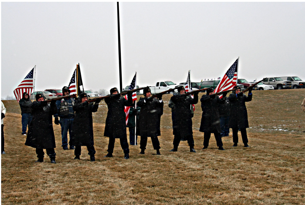
"Wreaths Across America" at Great Lakes Cemetery

Members of the ceremonial team visited Independence Village to honor their veterans, and provided a "Former POW/MIA Recognition Day" ceremony for a POW veteran at Milford Park Place. Visitations to area nursing homes were part of the Memorial Day activities.